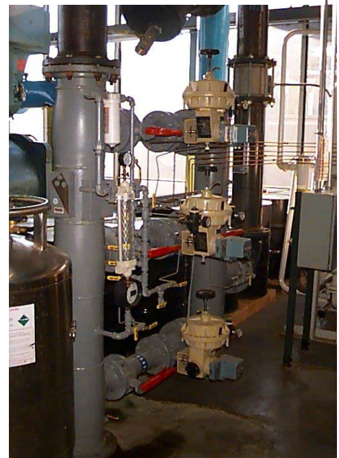
Figure 3: Primary Regulator Valves

air system by approximately 29%. First, TI implemented an aggressive leak control program. Next, TI removed 10-15% of unnecessary compressed air use from its facilities through an internal demand side management program. Third, TI improved its compressed air equipment by replacing its oversized and inefficient 200 horsepower (hp) air compressor with two 100 hp high efficiency air compressors and also rebuilt several compressor drive motors for higher operating efficiency. TI also initiated a rebuild of the primary base load steam turbine driven high-speed compressor located in the steam powerhouse. Based on their system approach, TI replaced their desiccant air dryers with refrigerated dryers, installed a central control system to sequence the compressor on and off as needed, installed control valves to regulate the pressure across the entire site +/- 2 psi. Finally, TI installed a central information and computer management system to allow system automation.