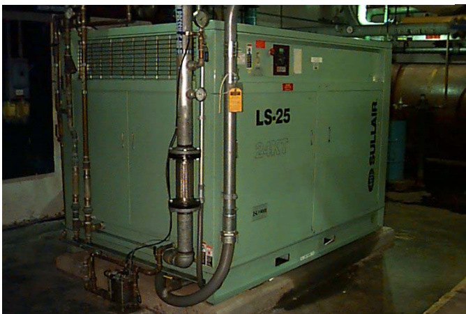
Figure 2: High Efficiency Enclosed Compressor

system, which equaled an additional $165,000 in annual electricity use alone not including demand charges. The audit also identified several poor system design elements, system misuse, as well as insufficient system dynamics issues. TI used the audit as a tool to identify opportunities to improve energy efficiency and productivity of its compressed air system.