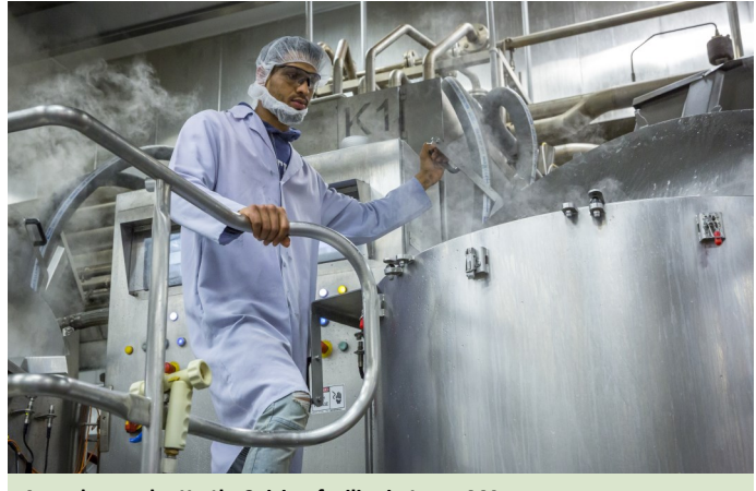
A worker at the Kettle Cuisine facility in Lynn, MA

In addition, TURI began working with Kettle Cuisine to reduce the use of sodium hydroxide used in cleaning applications. Processes using sodium hydroxide were optimized to reduce use, and alternatives were identified. In FY19, testing of alternatives will be done at the facility.