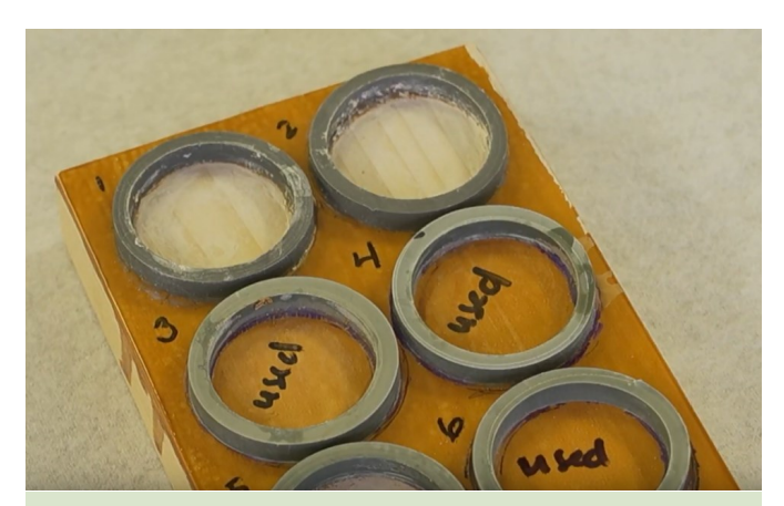
Test board used to demonstrate the effectiveness of the alternative paint stripper at the TURI Laboratory

Over the course of this research, three existing safer chemicals were identified that, when combined in a certain ratio, remove most paint coatings within 20 minutes, which is comparable to the time it takes for products that contain methylene chloride. While trying to find a viable solution, the TURI researchers filtered out any chemicals with significant known toxicity issues and then worked with the safer chemicals to develop a solution that performed as well as methylene chloride. In addition, a toxicology firm and two other universities provided independent environmental health and safety evaluations. The next step is for the UMass Lowell Office of Technology Commercialization to identify industry partners to commercialize this new paint stripper formulation.