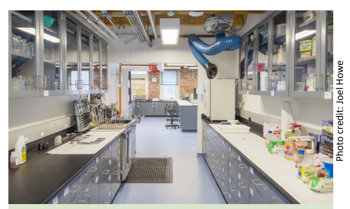
New laboratory space at TURI's offices

In FY18, TURI moved to new offices in Boott Mills, Lowell, and gained a new and larger laboratory space. The expanded space allows lab staff to conduct more comprehensive trainings with student groups and facilitates shared testing with companies and with research partners.