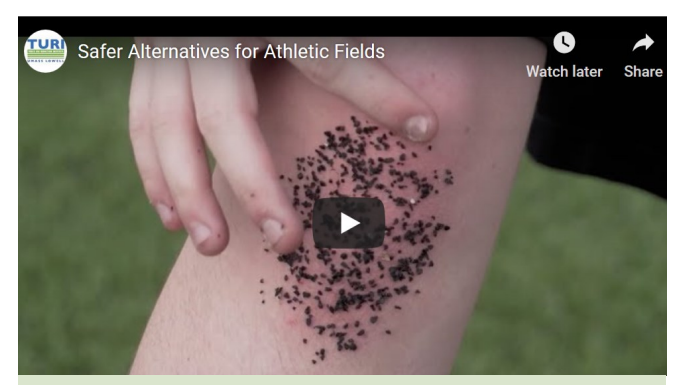
The first frame of TURI's artificial turf video showing crumb rubber infill

Among other services to Massachusetts communities, TURI provided a grant to support a parent-designed project on Martha's Vineyard to establish organic management of natural grass sports fields; contracted with a laboratory to test alternative infills; provided a webinar about playing surfaces; and created a video that provides an overview of concerns related to artificial turf.