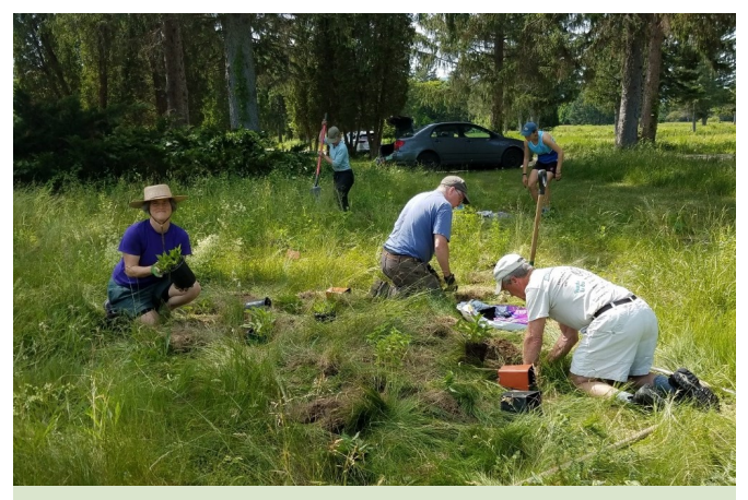
Bee Friendly Williamstown volunteers planting a public field with organic pollinator-friendly plants.