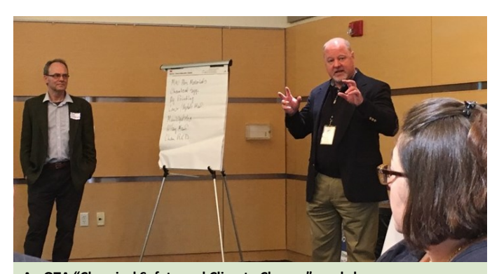
An OTA "Chemical Safety and Climate Change" workshop

OTA is supporting the City of New Bedford with the implementation of their Municipal Vulnerability Preparedness plan by assisting city facilities with chemical safety and climate change preparedness.