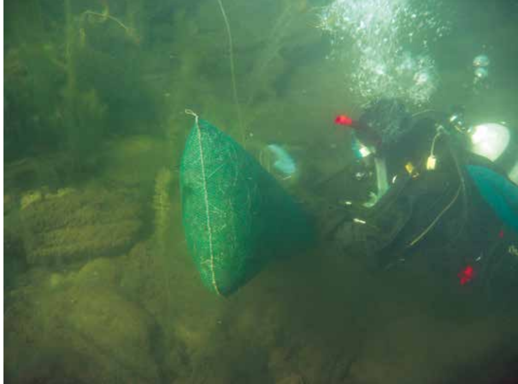
Figure 2. Pro-Diver Jo Smith on November 4, 2008 using the Wrap Method at the Big Rock patch that had been treated with diquat that year in June.

Skimmers get training in identification as well so they pick up fragments of the invasives and can leave pieces of the native plants that come up. Polarized sunglasses are very helpful to see the fragments in the water column, as some fragments do not come up to the surface. Another useful tool is an underwater viewer, or bathyscope, both to find and mark locations of EWM, and also to look for fragments that stay under the surface. An ideal skimming boat is a small canoe that can be deftly managed by one person yet have plenty of room for a skimmer net, extra diver bags, a bathyscope, weed markers, a little bucket for fragments, the dive flag/float, an anchor in case of emergency, and taking in the full weed bags from the diver (after holding them over the side to de-water)