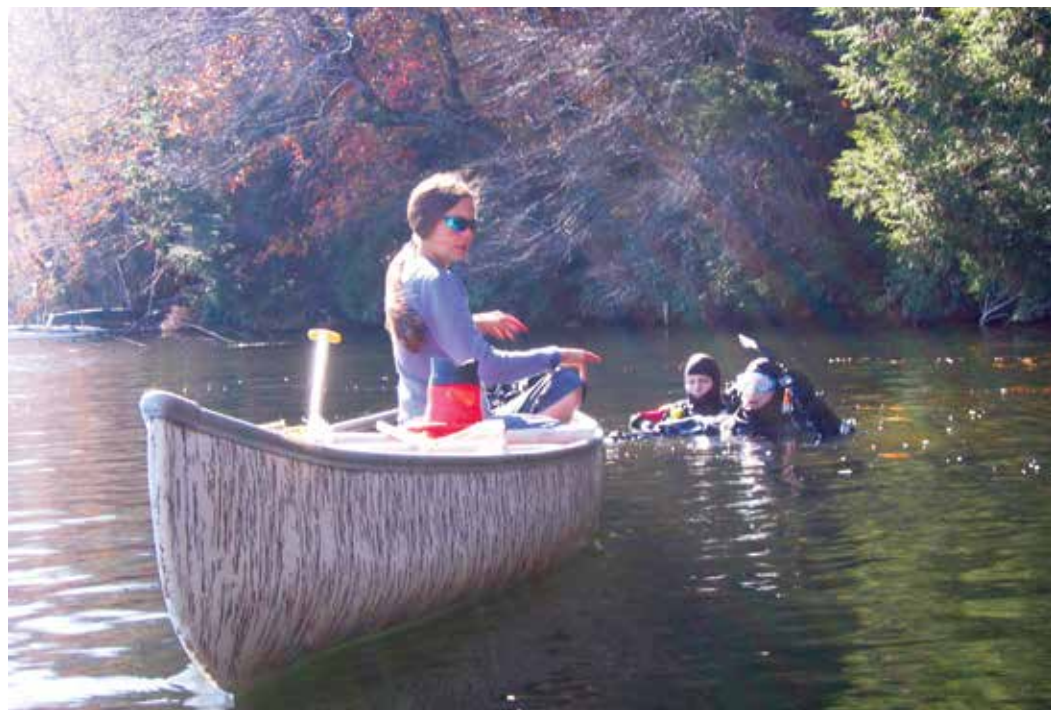
Figure 3. The author, in the canoe, skims and collects harvested plant fragments.

These divers were professional in every way, most having dry suits as well as wet suits. We call them our Pro-Divers and can recommend them for hire at other lakes. For many years our funding was limited so that we were only able to hire them up until the end of May and again after October 15, and relied upon