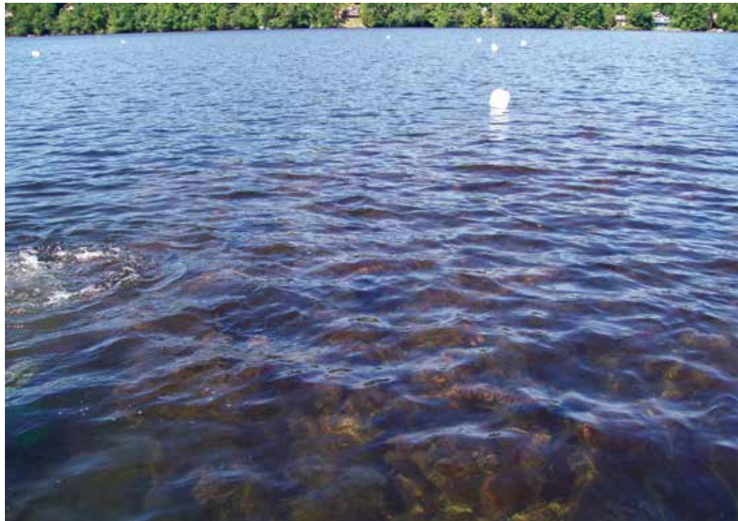
Figure 1. EWM patch CLE#2 in June 2010 with our diver beginning the last dive pulling that one out. Patch CLE#3 can be seen marked in the background.

Our two divers in 2002 developed good hand-pulling methods right away, so it wasn't until 2003 when we hosted lots of volunteer divers that we learned