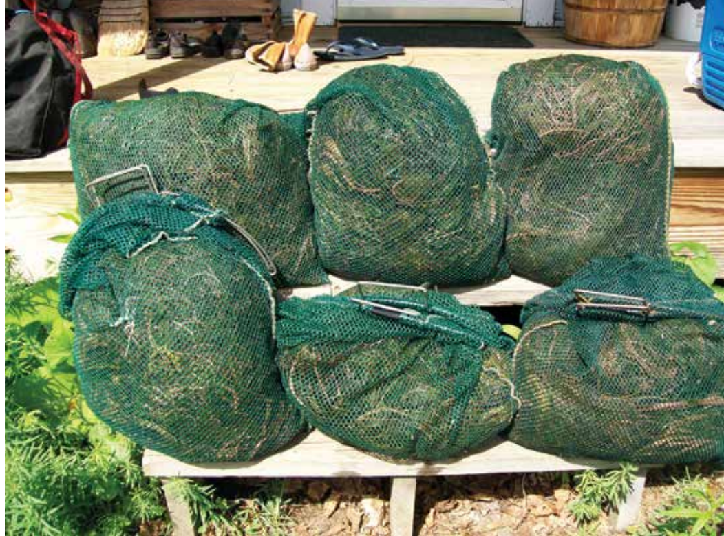
Figure 4. The EWM harvest de-watering prior to composting from a dive in June 2009 with one Pro-Diver and one Volunteer.

The total cost for our project in 2009 was $11,648, our highest cost year. 2010 was $8,282. The cost over the last four years has varied, averaging approximately $5,000 per year, with 2013 and 2014 coming in under $4,500. Since having the support of the lake association along with more significant funding, the general trend over these six years has been a reduction in the amount of EWM, and the management time and expense has been reduced correspondingly, but leveling off the last two years. Dives cover more territory than in the past, as divers are spending less time stopping to pull plants, so fewer dives are needed per area. However, there has been no reduction in the area that needs to be covered, and some harvesting is still required in all areas of the lake each spring and fall. Because the divers find many more plants and fragments on the bottom than we detect from the surface, to date we have had our Pro-divers swim through all areas. Further reduction in costs may involve