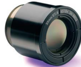
35mm f/1.4 athermalized lens

During this same time period, Ophir contacted the Massachusetts Office of Technical Assistance (OTA) for ideas and assistance in reducing its generation of hazardous waste. OTA engineers evaluated the processes that use toxic chemicals and create hazardous waste, and provided a number of