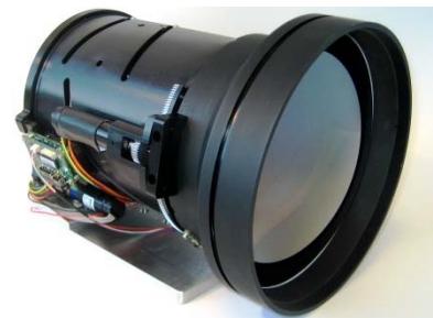
25-225mm f/1.5 continuous zoom lens