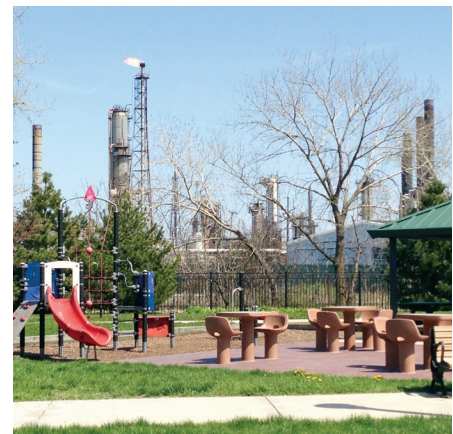
Global Community Monitor

Social and environmental justice lies at the heart of our work. Individuals and communities marginalized by society often bear the additional burden of being on the frontline of toxic exposures. Social and environmental justice can be advanced through Toxics Use Reduction. Our efforts strengthen the protection of workers, children, minorities, and other groups at greatest risk from the use and release of toxics in their communities.